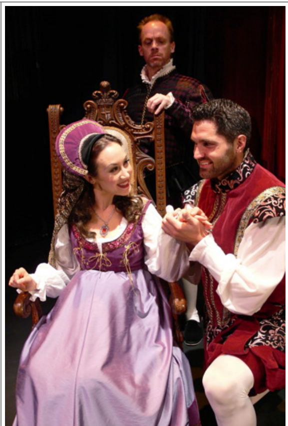
A Wither's Tale

AUG – 26 | NO COMMENTS | RELATED : REVIEW , THEATER